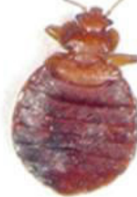
Adult (5.5 mm long) Takes repeated blood meals over several weeks.