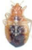
Third Stage Larva (2.5 mm long) Takes a blood meal then molts.