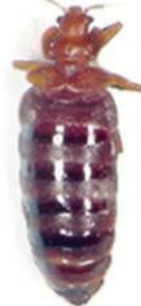
Adult Female (6.5 mm long) Females lay up to 5 eggs per day, continuously.