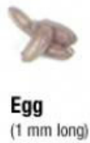
Egg (1 mm long)

who you will be sleeping with tonight !!