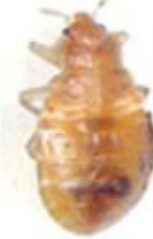
Fifth Stage Larva (4.5 mm long) Takes a blood meal then molts.