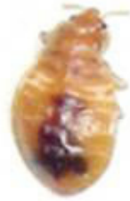
Fourth Stage Larva (3 mm long) Takes a blood meal then molts.